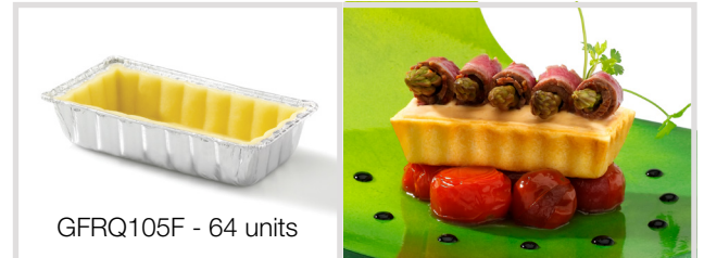
105mm Rectangle Fluted Savoury Shell