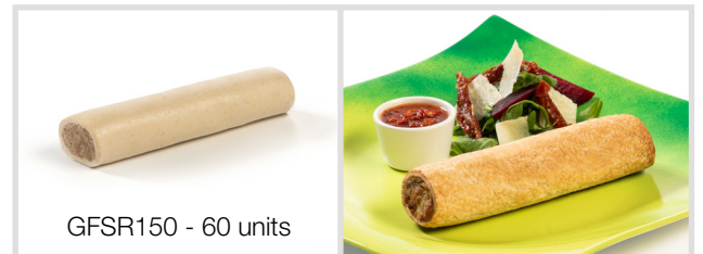
150mm Beef Sausage Roll