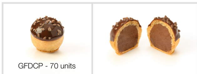
Double Chocolate Profiterole