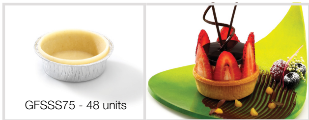
75mm Shortbread Shell (Straight Sided)