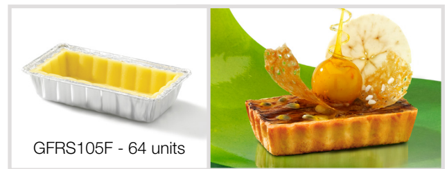
105mm Rectangle Fluted Shortbread Shell