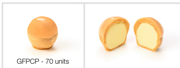
Passionfruit Curd Profiterole