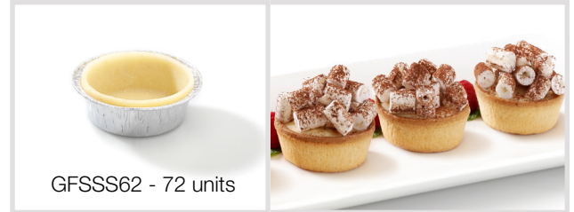
62mm Shortbread Shell (Straight Sided)