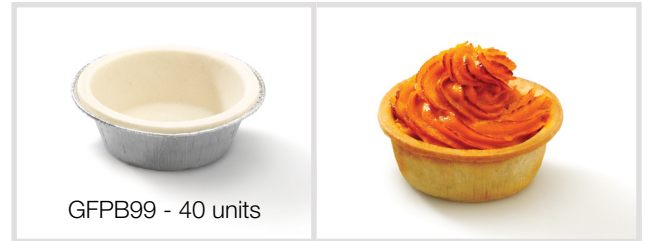
99mm Savoury Pie Shell