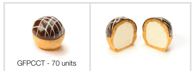
Patisserie Cream Profiterole