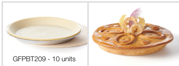
209mm Savoury Pie Shell with matching Puff Pie Top